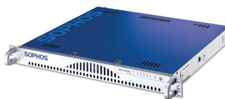
ES4000 and ES1000: fully integrated email gateway protection from Sophos